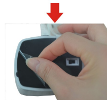
Step 4: Tear off the 3M sticker of the holder bottom.