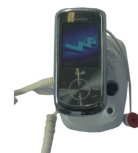
Step 7: Put the Connectors on the product (Need to press at least for 10 minutes)