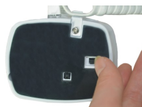
Step 2: Slide the switch on the bottom of the power, turn on power.