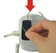
Step 6: Tear off film of Connectors.