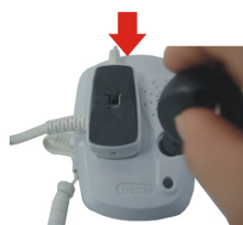
Step 3: The remote controller aim at the signal receiver Parallel, press the remote controller within 15mm To activate the holder. (The moment of pressing the remote button, the host will issue a bit of tone)